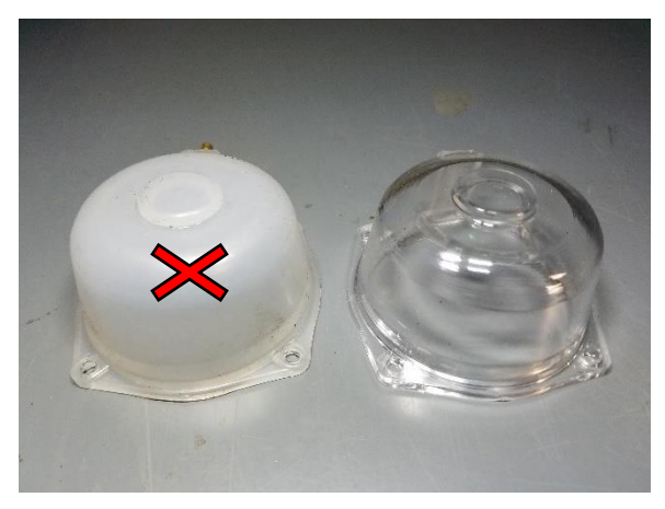
Fig (2) 40 HP Carburetor Bowl, , red X indicated improper part