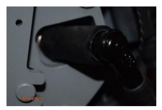
Fig (6) 2" Boot Cover installed

5. Fuel Lines. Replace all clear (yellow) fuel line(s) with USCG compliant Reinforced BLACK gasoline/diesel fuel compatible fuel line(s). Black fuel line is more resistant to heat and chemical degradation. Replace at earliest maintenance or repair availability. (see fig and 8)