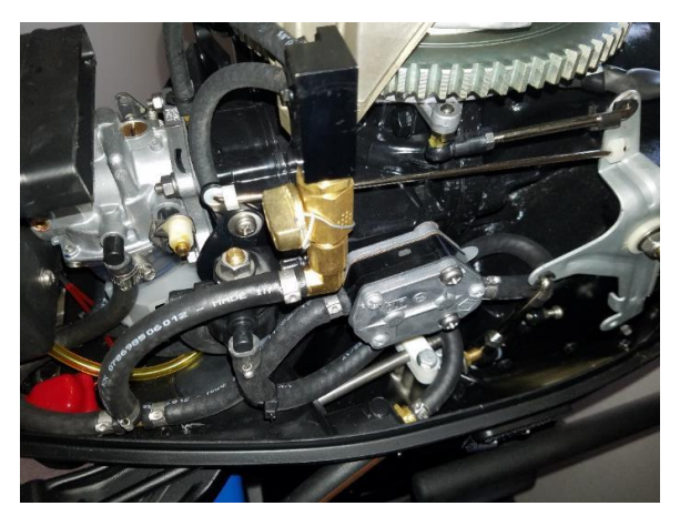
Fig (7) Raider 40HP with USCG compliant lines installed

5. Fuel Lines. Replace all clear (yellow) fuel line(s) with USCG compliant Reinforced BLACK gasoline/diesel fuel compatible fuel line(s). Black fuel line is more resistant to heat and chemical degradation. Replace at earliest maintenance or repair availability. (see fig and 8)