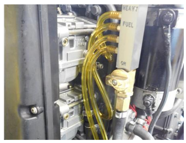
Fig (10) Raider 50HP with Tygon tubing fuel line