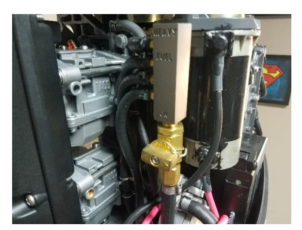
Fig (8) Raider 50HP with USCG compliant lines installed