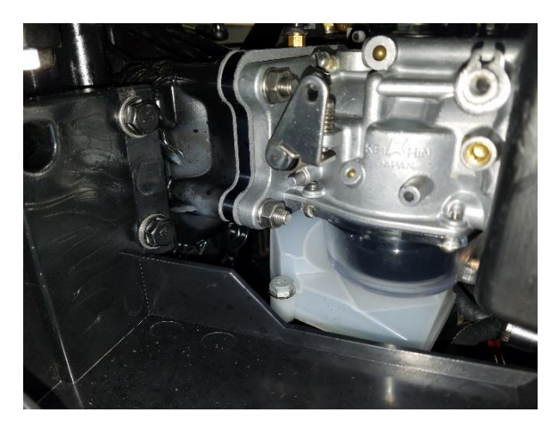
Fig (4) 40HP Carburetor Bowl, installed

4. <u>Spark Plug Boots.</u> Inspect spark plug boots; two-inch (2") boot provides protection from heat source in case of fuel under cowling. Replace "short" boots if discovered at earliest maintenance or repair availability. (see fig 5 and 6)