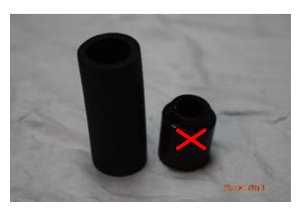
Fig (5) 2" Boot Cover vs. NGK Boot Cover, red X indicates improper part