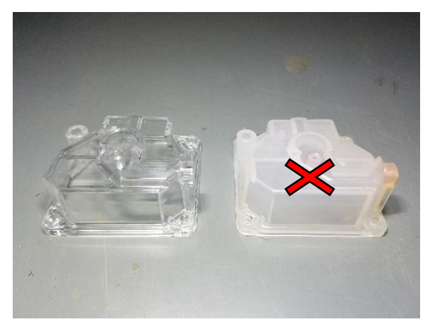
Fig (1) 50HP Carburetor Bowl, red X indicated improper part